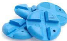
Rubber Tool for cable support, item no. 98028785